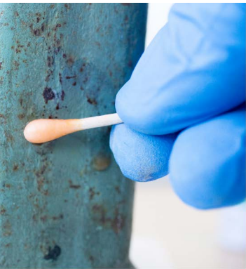
Orange = no chromium-6 Examples of tests on paint layers

The test kit contains 25 test swabs, a dropper bottle, a test sample, and an English manual. Manuals of other languages and safety data sheets can be downloaded using the QR code provided.