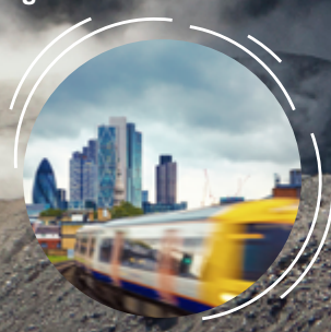
Impact of transport (road, rail)