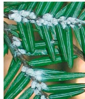
Adelgid infestations are easily recognized by the cotton like appearance on the base of hemlock needles.