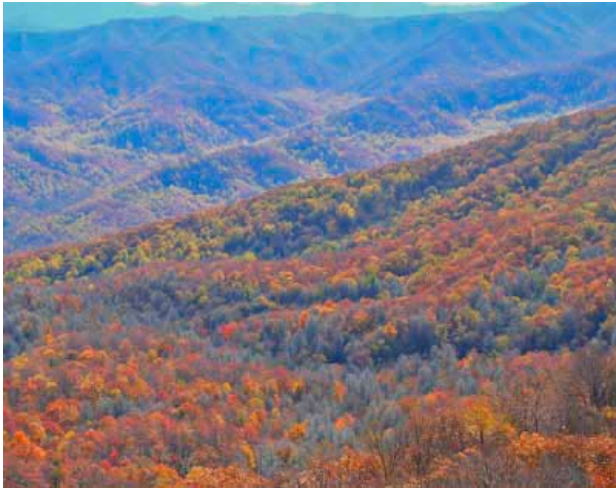
Swaths of grey in this photo demonstrate patches of dead hemlocks from the woolly adelgid.

Research sites are located in eastern Kentucky at Kentucky Ridge State Forest, Natural Bridge State Nature Preserve/Red River Gorge, and Robinson Forest. At each site, three hemlock dominated headwater streams have been paired with three deciduous dominated streams with similar physical characteristics for a total of eighteen study streams.