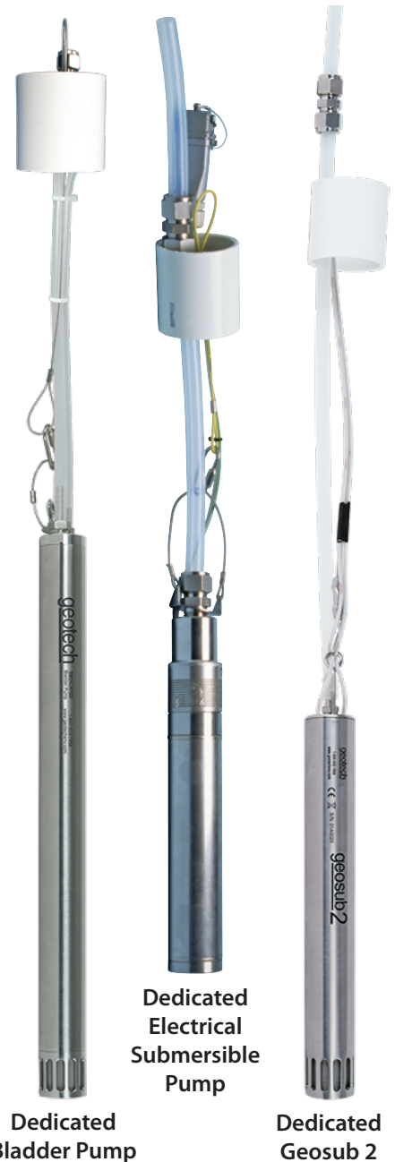
Dedicated Bladder Pump