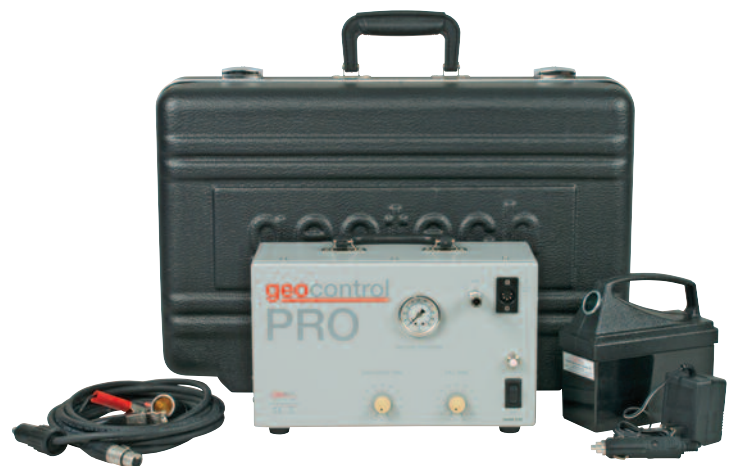
geocontrol PRO™ with optional carrying case and 12 Volt battery and charger