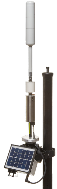
Dual probe configuration (without radome)