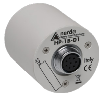
Magnetic field probe

This means that emissions from high-voltage cables and transformer stations can be recorded. Further, it is possible to combine up to two probes, e.g. an electric and a magnetic field probe in the so-called “dual probe configuration”.