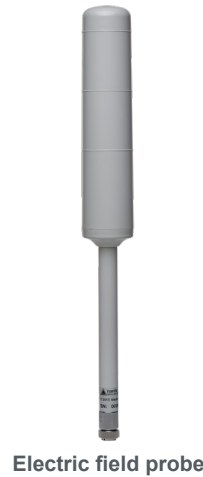
Electric field probe