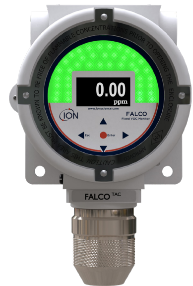
Diffused TAC (10.0eV) model