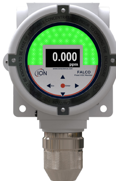
Diffused 10.6eV model

Registering your product online within one month of purchase will extend its warranty.