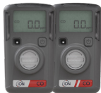
ARA CO ARA CO Hibernation