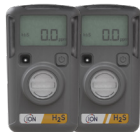
ARA H 2 S ARA H 2 S Hibernation

ARA Single Gas Detectors comprises six models including four gas types: Hydrogen Sulphide, Carbon Monoxide, Oxygen and Sulphur Dioxide.