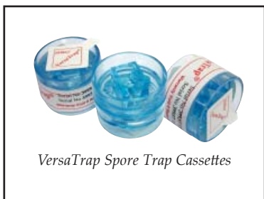
VersaTrap Spore Trap Cassettes