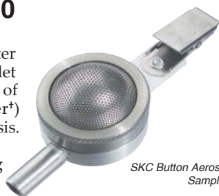
SKC Button Aerosol Sampler

The SKC Button Aerosol Sampler is a reusable filter sampler with a porous curved-surface sampling inlet designed to improve the collection characteristics of inhalable dust (< 100- \mu\text{m} aerodynamic diameter † ) including bioaerosols for viable or non-viable analysis.