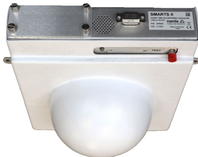
Fig. 1. SMARTS II on ceiling

The alarm threshold is field adjustable from 10% of standard to 50% of standard. The user can easily switch from battery operation to an external, low voltage DC supply.