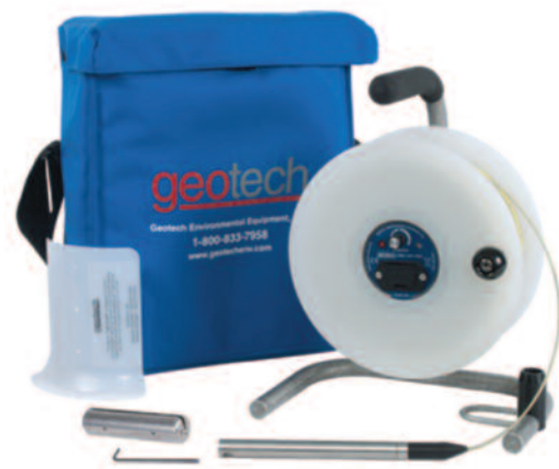
Geotech ET with optional bag and tape weight