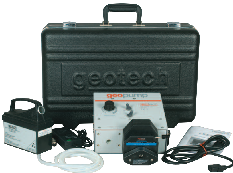
Geopump™ Peristaltic Pump Series II Kit with optional easy-load II® pump head, modular battery, 5 ft. (1.5 m) tubing, carrying case and power cord