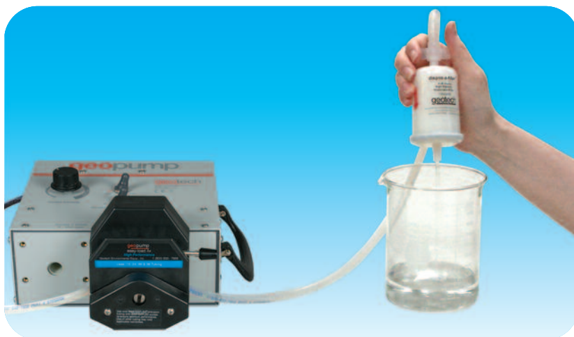
Sample collection with the Geopump™ Peristaltic Pump Series II with optional easy-load II® pump head (dispos-a-filter™ capsule sold separately)