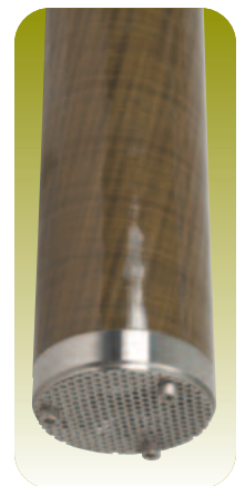
Bottom Fill with Flat Screen