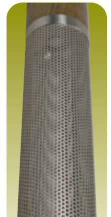
Bottom Fill with 12" (30.5cm) Screen