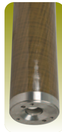
Bottom Fill with No Screen