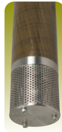
Bottom Fill with 3" (7.6cm) Screen