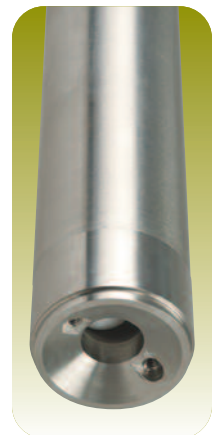
Bottom Fill with No Screen