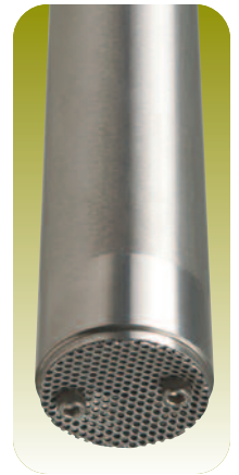
Bottom Fill with Flat Screen