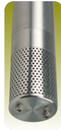
Bottom Fill with 2" (5cm) Screen