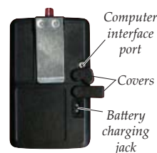
Battery attached to pump