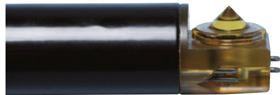
Standard 1" (2.5 cm) Intrinsically Safe Probe