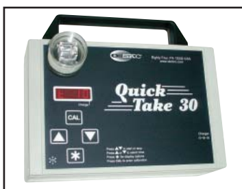
VersaTrap Cassette mounted on QuickTake 30 Sample Pump

The SKC QuickTake® 30 sample pump is especially easy to use with VersaTrap as it is designed for spore trap cassettes to mount directly onto the pump and supplies the features and accessories most needed for bioaerosol screening. The highly versatile QuickTake 30 sample pump can also be used with wall samplers, standard filter cassettes, impactors, and remote media. A programmable timer allows unattended sampling.