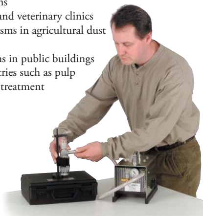
BioSampler set up with Vac-U-Go pump