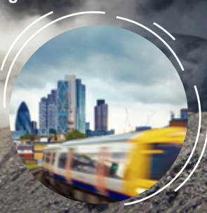
Impact of transport (road, rail)