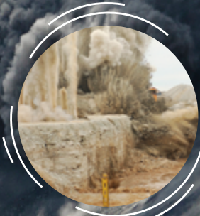
Explosions (mines, tunnels)