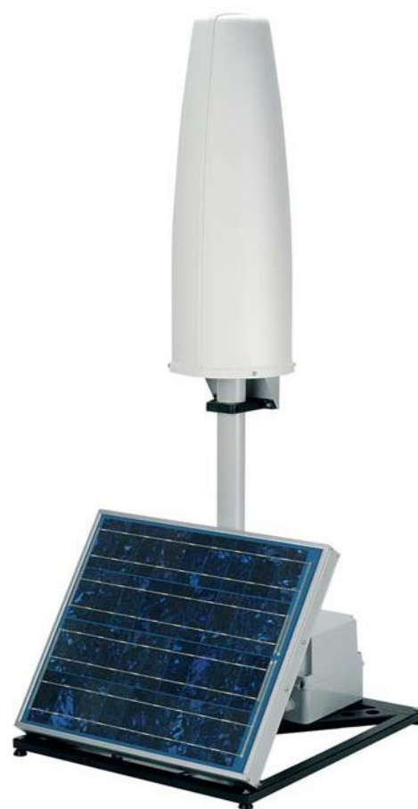
Area Monitor AMS-8061 with Solar Panel