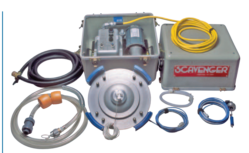
Large Diameter Filter Scavenger system with optional case

When approximately one liter of hydrocarbons collects in the buoy base, a float switch is activated, turning the pump on. Thus, water-free product is automatically pumped into a recovery tank. A water sensing switch is also located within the buoy. Should water enter the buoy, a density switch is activated, shutting off the pump and activating an alarm light. This automatic feature prevents recovered hydrocarbons from being contaminated by water.