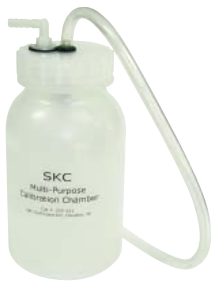
Multi-purpose Calibration Jar Cat. No. 225-111