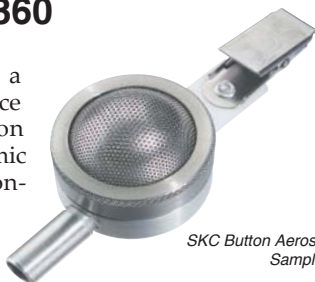
SKC Button Aerosol Sampler

The patented* SKC Button Aerosol Sampler is a reusable filter sampler with a porous curved-surface sampling inlet designed to improve the collection characteristics of inhalable dust ( < 100 \mu\text{m} aerodynamic diameter † ) including bioaerosols for viable or non-viable analysis.