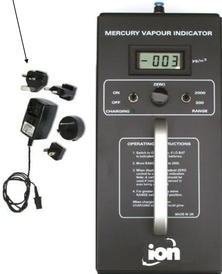
Universal Battery Charger (A-26220)