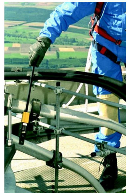
RadMan XT used as an instrument for leak detection