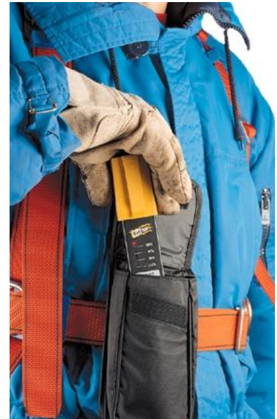
RadMan XT used as a personal monitor for radio frequency fields

As a locating unit all RadMan versions can be used to locate leaks on waveguides and coaxial screw connectors (picture on the right). A non-conductive extension with handle is available as an optional accessory.