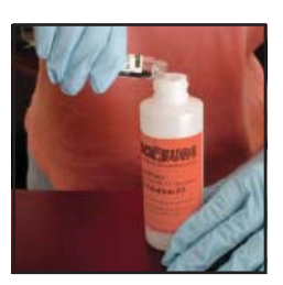
Pour one vial of Disclosing SR Powder #1 into Developing Solution #3 spray bottle.